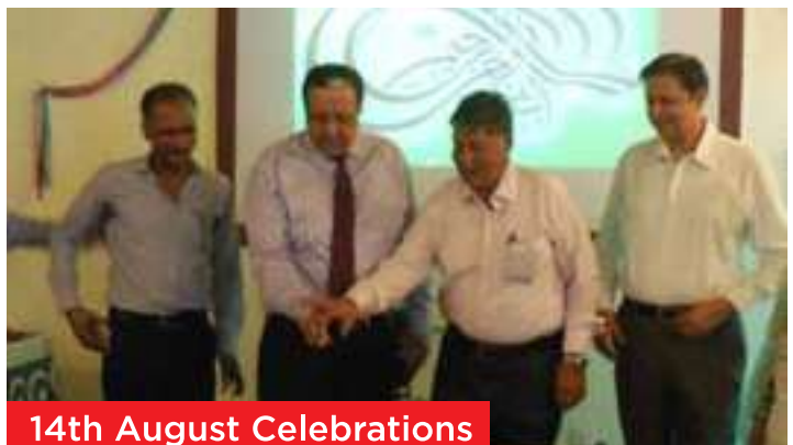
14th August Celebrations