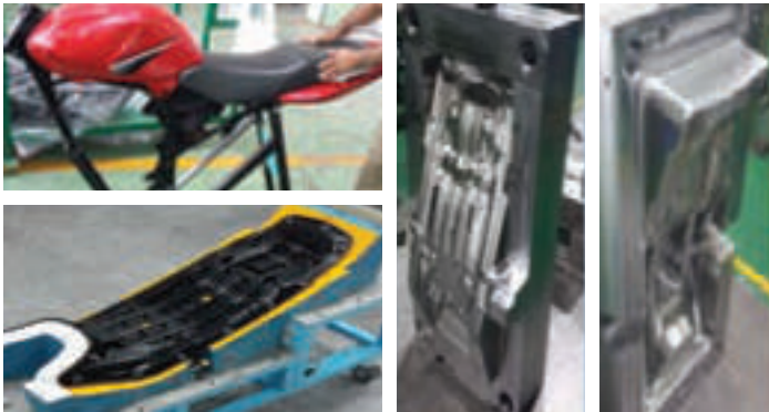
Molds and CFs

PCI Automotive has a history of making the most of every situation. When Yamaha Motors started production in Pakistan, it was PCI Automotive's dynamic team of professionals who targeted Yamaha Motorcycle seats as a potentially diversified business opportunity. And after rigorous efforts, in October 2014, development of Yamaha Motorcycle seats began.