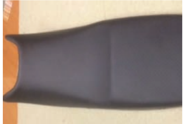
Motorcycle Seat Assembly

In March 2015, the development of Yamaha Motorcycle seat was completed. In just six months, development of base, forming mold, leather, testing equipment development and trolley supply development was done with resounding success. With motorcycle seat assembly manufacturing, PCI Automotive has now opened a new world of opportunities in the two wheels automobile industry.