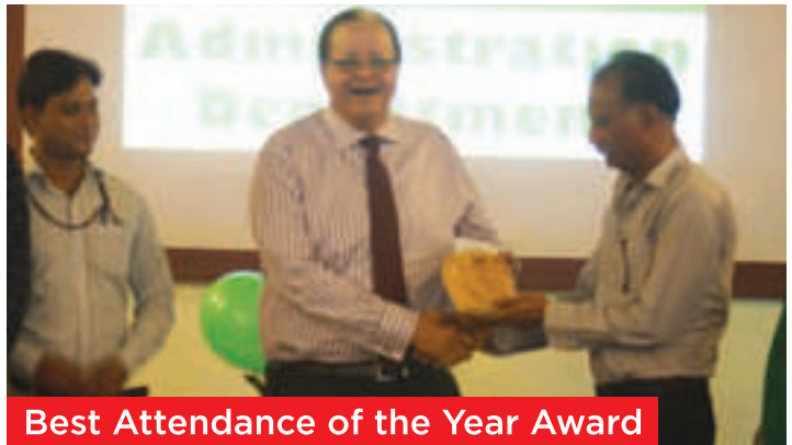
Best Attendance of the Year Award