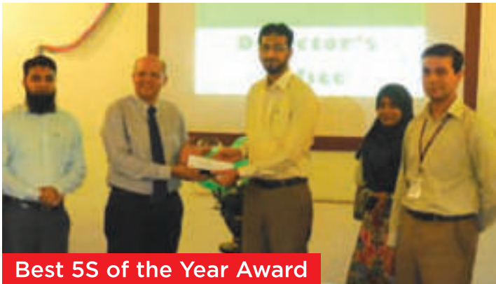
Best 5S of the Year Award