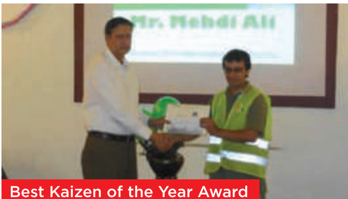
Best Kaizen of the Year Award