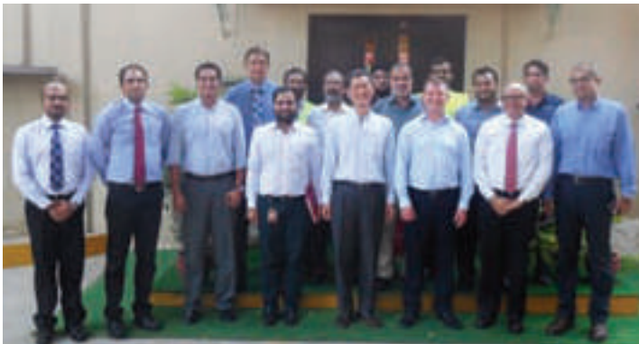
Visit from Global Teams

Packaging business is a whole new world and PCI Materials is striving and is very much capable of reaching the top of this world.