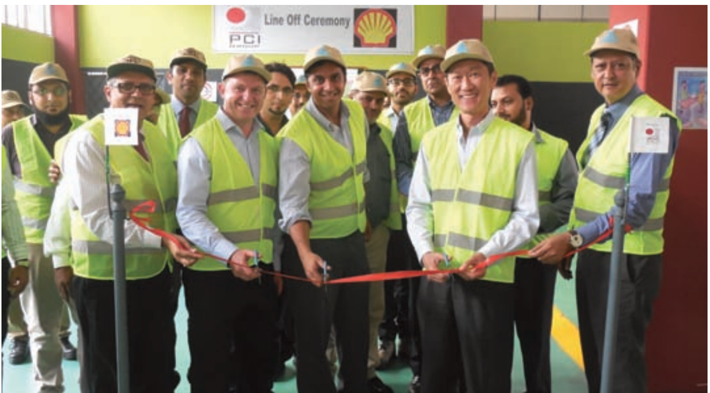
Plant Inauguration by Global Team